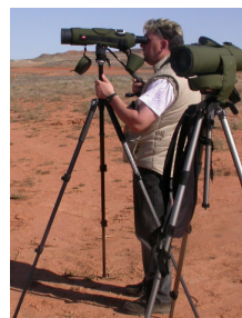
Nev at El Planeron

We returned south and stopped off near Huesca at Montearagon Castle . Although it was 1730h, it was very hot. We quickly found a pair of Black Wheatear and enjoyed excellent views. We finished the day off in Loporzano . At the cemetery there was much activity, mainly in the scrub and we saw 1 Egyptian Vulture , 1 Booted Eagle , 2 Tawny Pipit , 4+ Western Orphean Warbler , 1 Subalpine Warbler , 1 Sardinian Warbler , a pair of Cirl Bunting , Grass Snake and Brown Hare . After dinner 2100-2200h we got very close to 4 Scops Owl calling in the village but could not see any. Later we saw a Barn Owl which was screeching as it quartered the local fields.