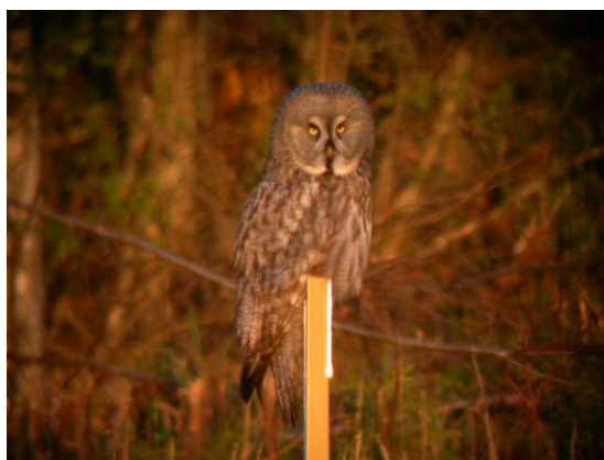
Great Grey Owl

The first bird of the day was a Common Crane feeding close to the road in a field near Oi Jarvi . Then at 0335h, one of our companions shouted for the bus to stop. He saw a large Owl we'd just driven past. We quickly realised we were looking at a fantastic Great Grey Owl sitting out in the open on a post about 75 yards away. We watched it for almost an hour as it hunted on massive wings before catching and eating a vole in front of us. What a bird!