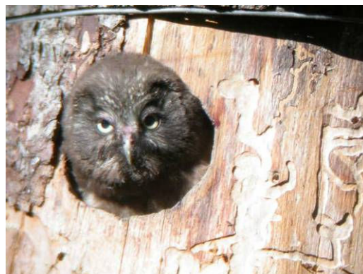
Tengmalm's Owl chick – "Feed me!!"

We tried unsuccessfully at several sites for Hazel Grouse , including Hakenharju , where a juvenile Tengmalm's Owl was looking for its next meal!, then near Pollokiatstratu where we saw a female Pygmy Owl at a nest box with her 3 young. Also present were several individuals of the northern races of Bullfinch and more borealis Willow Tit .