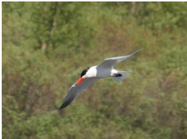
Caspian Tern at Kirkosalmi on Hailuoto Island

Our principal target for today, whilst enjoying a family day out, was to try and get Caspian Tern . By 1115h we reached Kirkosalmi marsh in the south of the island and from the tower hide and almost immediately found a superb bird fishing just yards away!