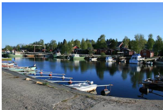
The harbour at Kiviniemi