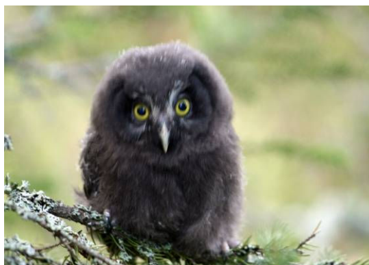
Tengmalm's Owl chick

We dipped on Willow Grouse and only heard 1 male Hazel Grouse in the woods. We then moved on to another clearing where a gorgeous juvenile Tengmalm's Owl was waiting to be fed by its parents. 10+ Common Crossbill were seen there, and then an Osprey flew over the bus carrying a fish as we made our way to Valtavarra Ridge .