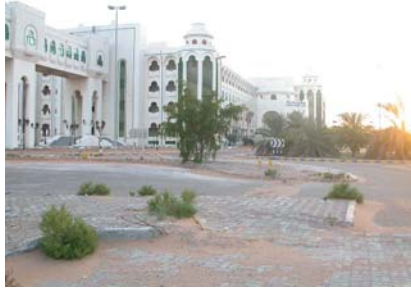
Ghantoot at dusk

We finished off at a disused hotel at Ghantoot at dusk and did not see much of note except 25+ Pacific Golden Plover on nearby playing fields. Two of our targets, some wintering Grey Hypocolius and Cream-coloured Courser, had recently left the site.