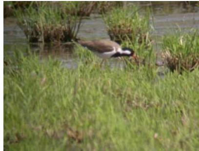
Red-wattled Lapwing at the Wadi Al-Ain

We reached Al Wathba Camel track at 1420 in the afternoon heat. We were rewarded with our target species immediately, 15+ Bimaculated Lark together with a fine Booted Eagle (dark). The nearby Al Wathba Lakes and environs were well populated with birds relatively common to the region like Greater Flamingo, Black-winged Stilt, Kentish Plover and Grey Francolin , but we only added Pied Avocet to our trip list there. The wintering Egyptian Nightjars had moved on apparently so we did not have to visit the site again at dark.