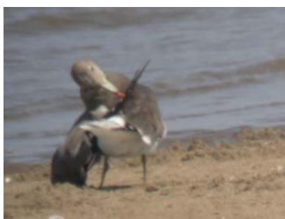
Sooty Gull at Fujairah beach

We moved off inland to the Hatta Dams in search of Lappet-faced Vulture and House Bunting. We were relatively unsuccessful, but managed nice close views of Desert Lark . Neil & Nev saw a House Bunting , but we saw little else. This site is also known as good for Lichtenstein's Sandgrouse at dusk, but they are very difficult to get!