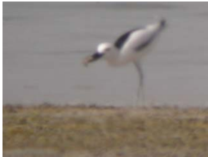
Crab Plover at Khor-al-Beida

soon yielded 6 Terek Sandpiper , 1 Common Greenshank , 3 Marsh Sandpiper , 2 Lesser Sandplover and 10 Gull-billed Tern . Nev also picked out a fine Greater Spotted Eagle roosting in a nearby bush!