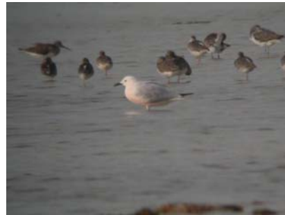
Slender-billed Gull at Dreamland Beach

We moved inland as the tide had not risen enough to bring in all the waders including another target bird, Great Knot. Our sustained efforts in the desert/dune area yielded a singing Greater Hoopoe Lark showing well together with 2 male Black-crowned Sparrow Lark , 2 male Desert Wheatear , 3 Isabelline Wheatear and an Asian Desert Warbler .