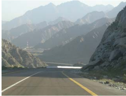
The road into Dibba

Our planned dawn start on the east coast was delayed by unexpected thick fog. As we made our way into Fujairah through Dibba after a difficult journey, the fog cleared to reveal stunning mountain scenery. We stopped for a break at the Masafi Wadi to try for Arabian Babbler again, to no avail, just a few Hoopoe, Pallid Swift and Red-tailed Wheatear.