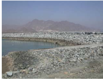
Swift Tern at Al Bidya harbour