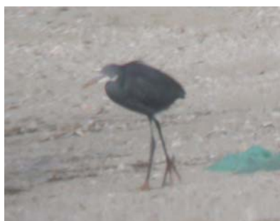
Western Reef Heron at Umm-al-Qaiwain

As a warm afternoon progressed we moved on to Khor-al-Beida for the slowly rising tide. As we worked through good numbers of Greater Flamingo and Western Reef Heron, we soon encountered another target species in 15+ Crab Plover , obligingly doing exactly what it says on the tin! This super site