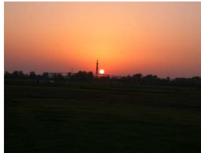
Sunset over the Mosque at the Pivots

We stopped off at Qarn Nizva , a regular roost site for Desert Eagle Owl , but were unlucky. All we got were some Camels and a fleet of off-roading Arabs!! Perhaps someone should send Jeremy Clarkson out here?!