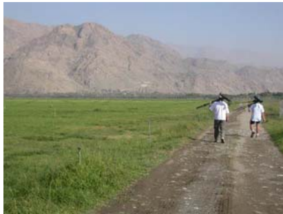
Fujairah Dairy Farm and the Omani border fence.

We reached Fujairah Dairy Farm at 0830. This is one of the best sites in the UAE for birding. At migration times just about anything can turn up. That wasn't to be today, but we still saw 1 Squacco Heron, Red-wattled Lapwing, Little Green-Bee-eater, Indian Roller, Purple Sunbird, 14 Chestnut-bellied Sandgrouse, Citrine Wagtail, Pallid Swift, 1 Masked Wagtail, 3 Bluethroat, Bank Myna, Indian Silverbill and House Crow. Also of note were a species of Ground Mantis and a Tiger butterfly.