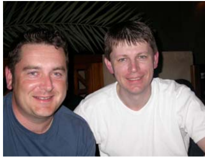
Hitting the town in Dubai!!