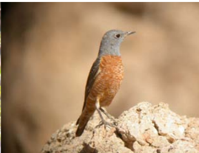
Rufous-tailed Rock Thrush