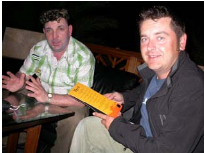
Dubai Night Life